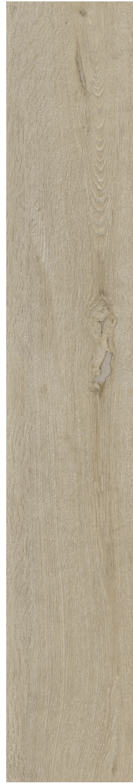
TAUPE 20 x 121 cm (8" x 48") Matte Finish DE.NB.TPE.0848