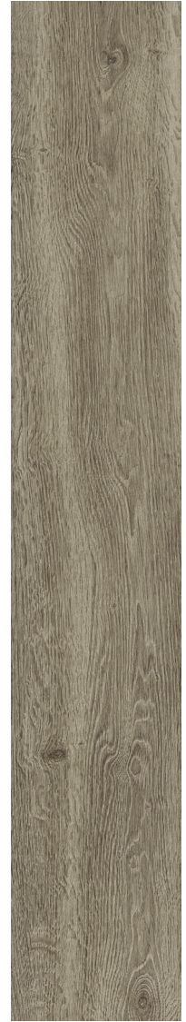
BROWN 20 x 121 cm (8" x 48") Matte Finish DE.NB.BWN.0848

All items shown in this document are part of Olympia's stocking program. For special orders, please contact your Olympia Tile Sales Representative.