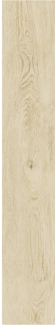
NATURAL (Beige) 20 x 121 cm (8" x 48") Matte Finish DE.NB.NAT.0848