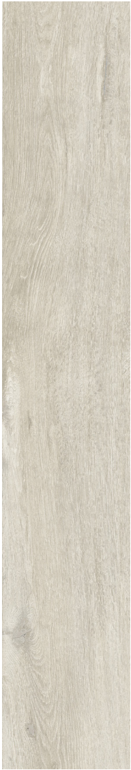
NEUTRAL (White) 20 x 121 cm (8" x 48") Matte Finish DE.NB.NTR.0848